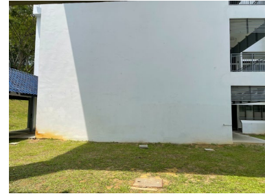
Site 3: Across Year 4 block