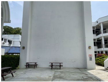
Site 4: Amphitheatre