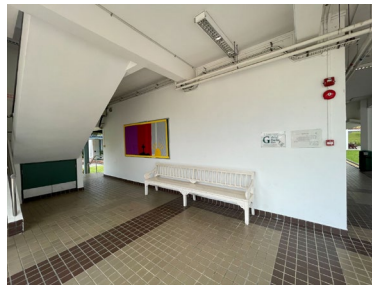
Site 5: Walkway to Chapel