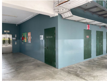
Site 2: By elevator & labyrinth