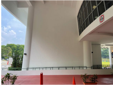
Site 1: Sheltered Drop-off Point