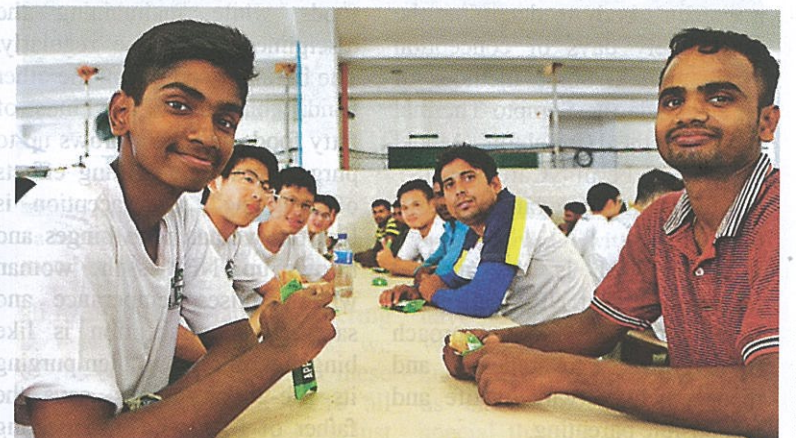
SJI scouts had tea with migrant workers who are renovating SJI's Malcolm Road campus.

rials for more than 12 hours every day."