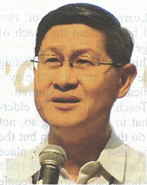
Cardinal Luis Antonio Tagle urged participants to 'see, hear and touch the wounds of others.'

"Employers of low-wage workers are cutting corners and using unfair contract terms to take advantage of their vulnerable situation.