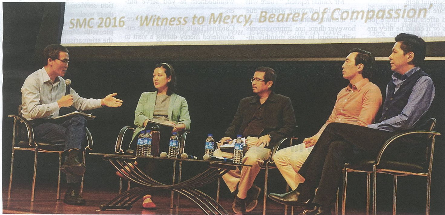
SMC 2016 'Witness to Mercy, Bearer of Compassion'

The Social Mission Conference discussed ways Catholics can reach out to the poor