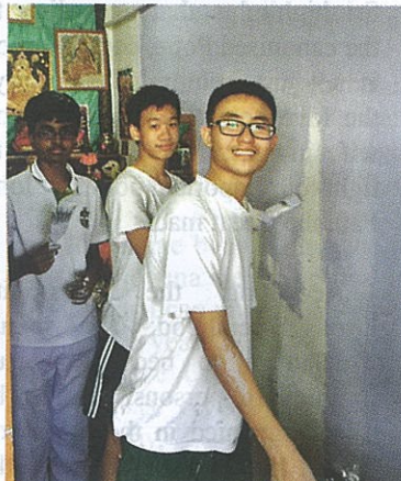
Students painting the home of a needy family living in Toa Payoh.