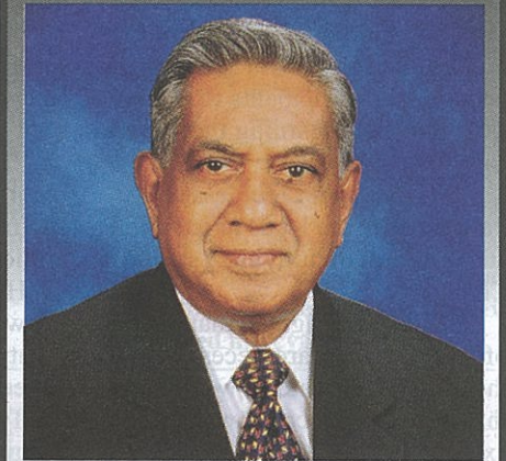
Mr S. R. Nathan (1924-2016).